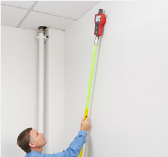
Trace wires in hard to reach places with insulation stick.

The NCV feature extends functionality of the AT-7000-RE Receiver by detecting energized wires from 90 to 600 V and 40 to 400 Hz without the use of the AT-7000-TE Transmitter. Its adjustable sensitivity fits a range of applications, from detecting presence of voltage (higher sensitivity) to precisely pinpointing a hot wire in a bundle (lower sensitivity).