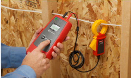
Induce signal with the signal clamp when there is no bare conductor.

Trace energized and de-energized wires enclosed in metal conduit by removing the junction box cover and using the AT-7000-RE Receiver's Tip Sensor to identify the specific wire carrying the transmitted signal generated by the AT-7000-TE Transmitter. Wires in non-metal conduit can be traced directly without opening the junction box and using the AT-7000-RE Receiver's Smart Sensor™.