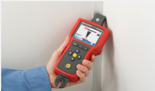
Use the Tip Sensor to trace wires in hard to reach areas.

The SC-7000-EUR signal clamp accessory can be used with the AT-7000-TE Transmitter to induce a signal into energized and de-energized wires when there is no access to bare conductors. Simply clamp around the desired wire to induce the signal, then begin tracing.