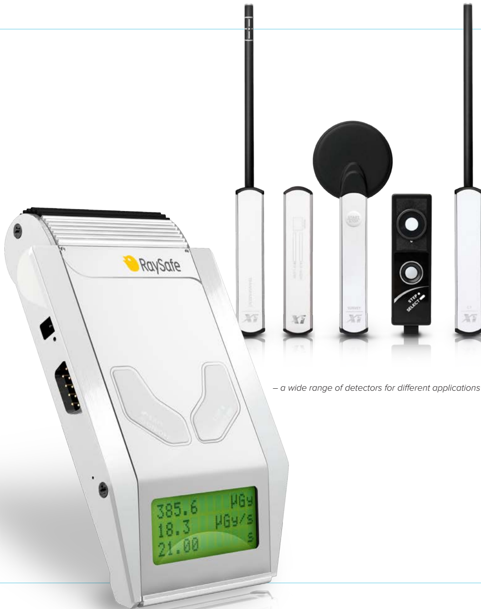
– a wide range of detectors for different applications