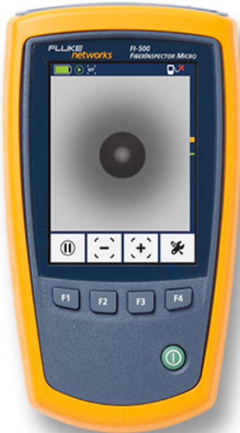
FI-500 displaying a clean fiber endface