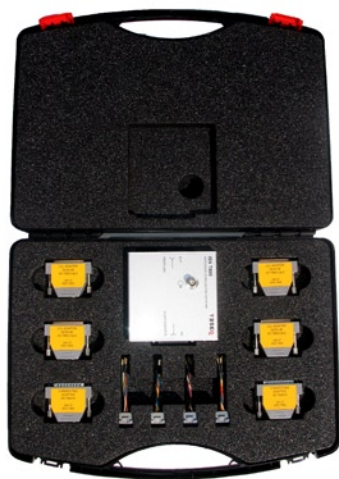
ISN T8 with adapter sets in suitcase