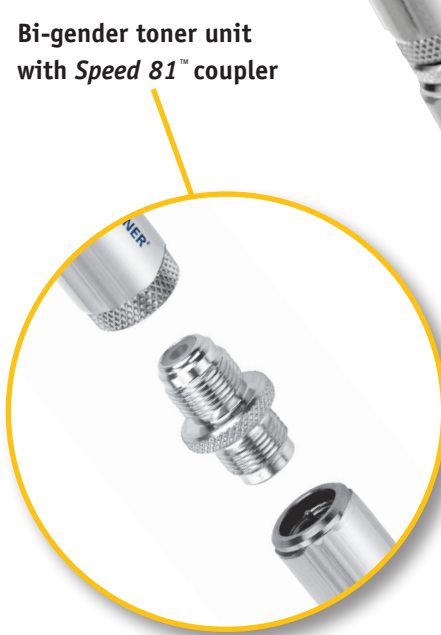
Bi-gender toner unit with Speed 81™ coupler

For more information: www.flukenetworks.com/PT